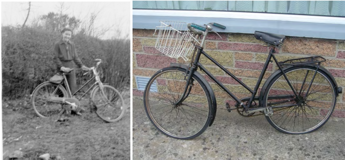
Figure 6. Left: Eileen and the bicycle she used in Omagh. Right: The same bicycle propped up outside Eileen's bungalow in Merrion Avenue, Newcastle some seventy years later in April 2008.

Eileen acquired a bicycle and rode it everywhere often going on cycling trips with friends. She had scratched her name on the handlebar and used the same bicycle (with only a few modifications) for more than seventy years, both in Omagh and throughout her married life in Belfast and Newcastle.