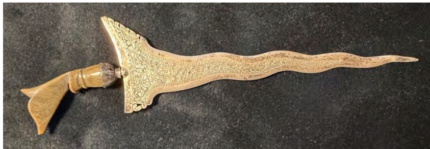
Figure 13. The “paper knife” referred to by Eileen is actually an asymmetrical dagger called a kris (see https://en.wikipedia.org/wiki/Kris ) associated with many of the cultures of South-East Asia.

“The paper knife is perfect. I have never in my life before, seen anything so uncommon – the more I show it around the more I love it. Have you seen it Frank? – the carving on the silver is magnificent.”