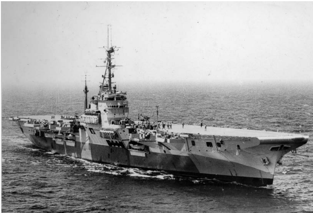
H.M.S. Glory was built by Harland & Wolff in Belfast and launched in November 1943.